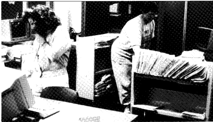
Figure 3. Irritation from paper fragments is especially common in offices and wherever files are stored.

increase levels of static electricity and the potential for problems from fragments or fibers. Static electricity may also cause body hair to move, giving the impression of insects crawling over the skin.